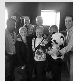
The North Grenville Business Builders